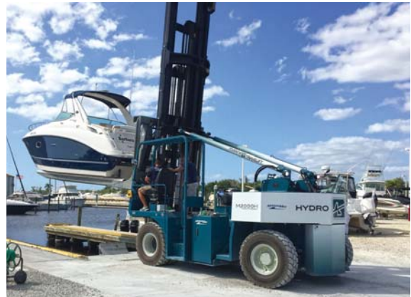
M2000H - Fort Myers, Florida