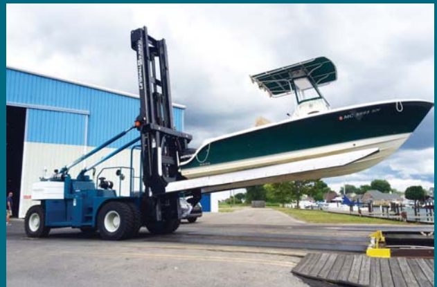
M2300H - Michigan, USA