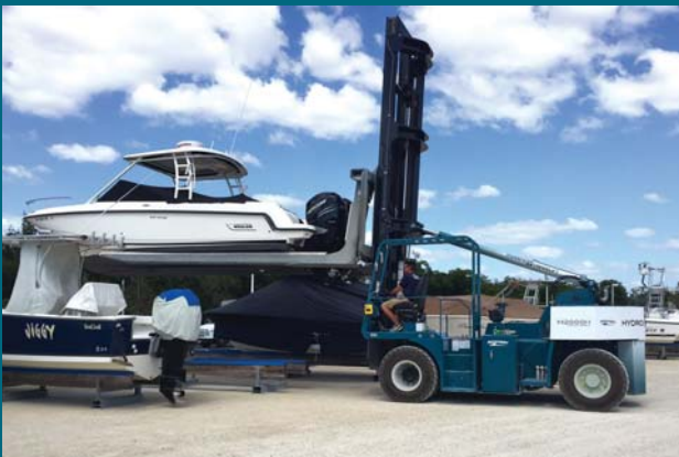
M2000H - Florida, USA

*Greater lifting heights will result in lower lifting capacities. See the load charts on model specification sheets.