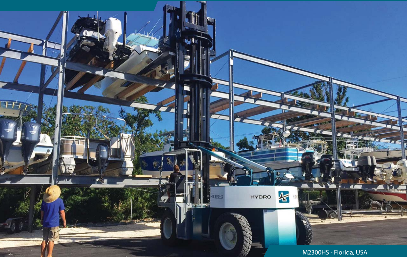
M2300HS - Florida, USA

After more than 25 years designing, building, and supporting our complete line of marine forklifts, Marine Travelift machines continue to surpass the rest with higher comparable lifting capacities that separate each model into a class of their own.