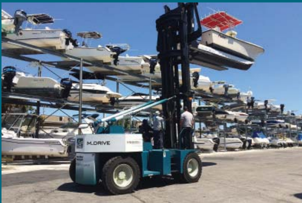
M2600H - Florida, USA