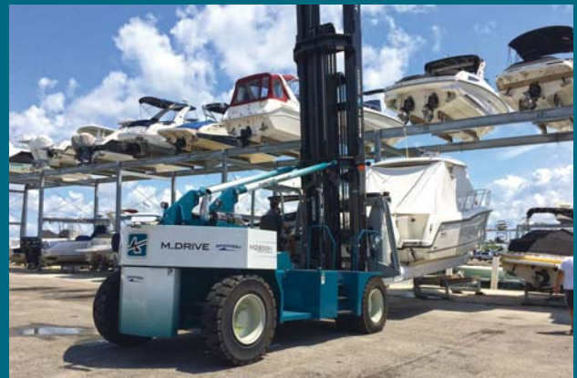
M2800H - Florida, USA