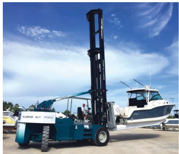
M2800H - Sarasota, Florida